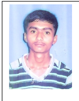
RAVIN (LBB15012) I RANK